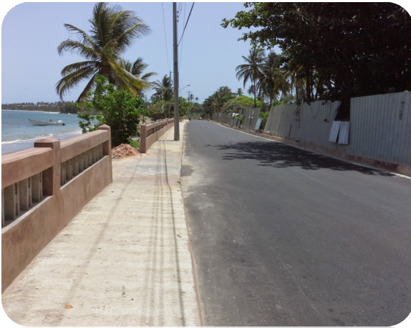
Bridge at Milford Road