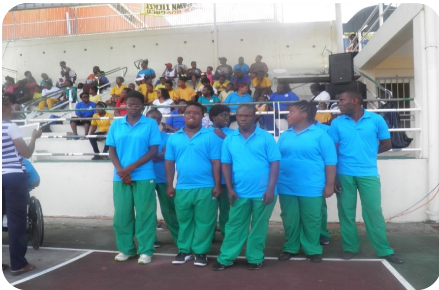
Sports and Family Day

49. The Vocation Centre for Persons with Mental Retardation programme aims to provide the differently-abled with a safe and secure environment where they can learn and interact with others. Twenty-nine (29) persons are enrolled at the Vocation Centre for Persons with Mental Retardation. This Centre is part of the Disability Affairs Unit which seeks to improve the inclusion of persons with disability within society. The participants have various disabilities and were provided with academic training (e.g. Computer Studies, Remedial Mathematics and English); vocational training (e.g. food preparation and woodwork); life skills training; and participated in social events (e.g. the annual Special Children's Fun Day held by the Power Generation Company of Trinidad and Tobago (PowerGen) in Penal, Trinidad), educational field trips and physical activities. Training and academic assessments are ongoing. It is hoped the Centre can accommodate in the future the nineteen (19) remaining persons that are on the waiting list when it is moved to its new location.