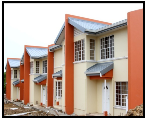
Townhouses at Adventure Estate