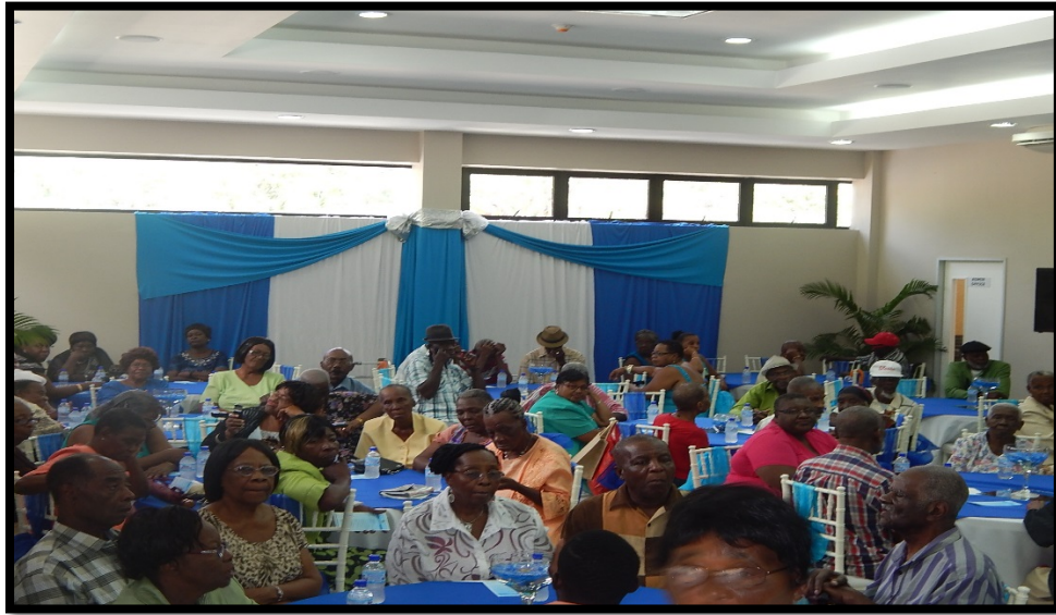
Senior Citizens Luncheon