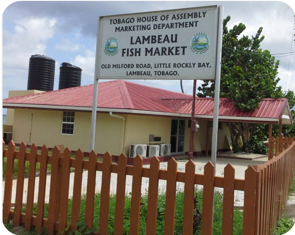
Lambeau Fishing Facility