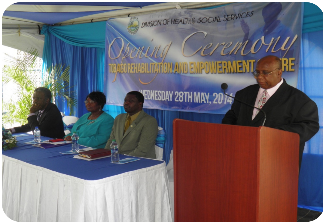
Opening Ceremony of TREC

14. The fund provided to the TRP was used for the rehabilitation of persons dealing with substance abuse. In addition, repairs, upgrade works and outfitting were completed for the drug rehabilitation centre at Fort King George. Since its inception, the Alcohol, Drug Abuse and Prevention Programme (ADAPP) has provided educational services to various groups, namely, one hundred and thirty-four (134) persons 14 years old and under, one thousand and eighty-two (1082) persons between ages of 15 and 24 years and community outreach to two thousand and eighty-four (2084) persons. Ninety-six (96) families also received counselling during that period.