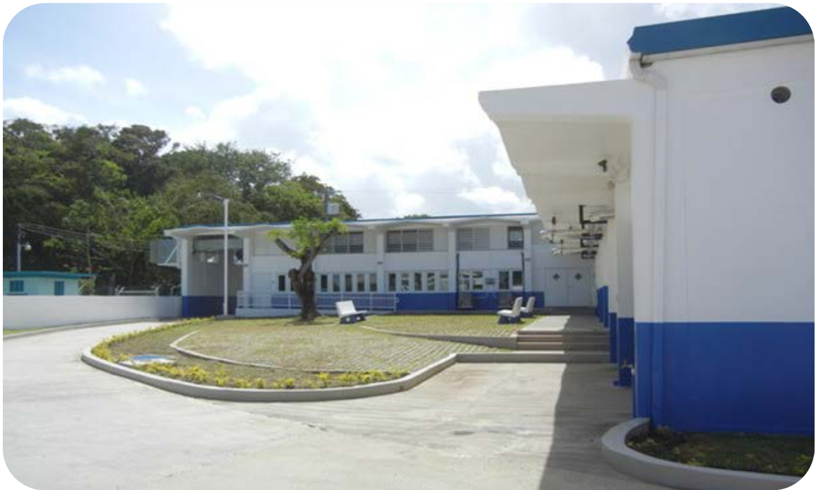
Refurbished and Upgraded Tobago Hospital Laundry: Exterior View