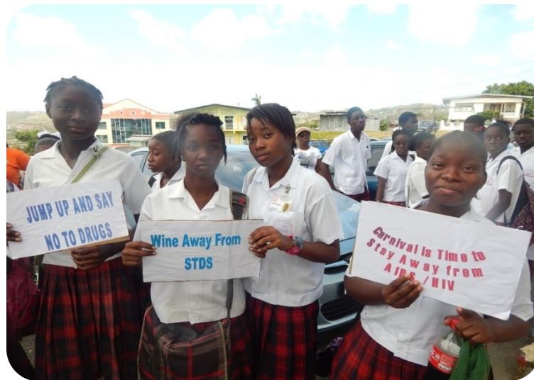
Children Carnival Awareness Walk

51. The Programme includes a School Intervention Project where it seeks to provide information on sexual education in schools starting at the Signal Hill Secondary School and PAM which has recently conducted its Carnival Awareness Walk where it had approximately 300 students attending