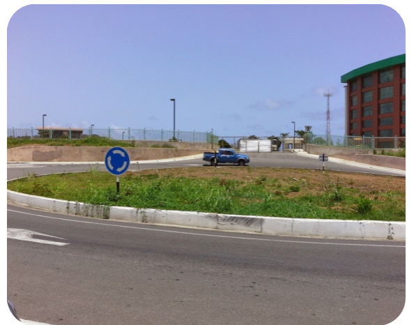
Shaw Park Roundabout